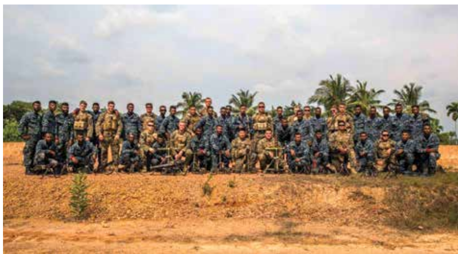
Cultural awareness and training will be required, not only for U.S. forces, but also for the average American.