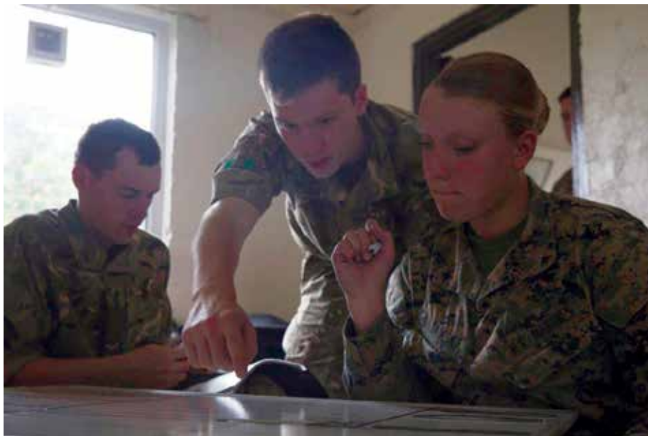
Successful operations against jihadists will require intelligence sharing between the U.S. and partner nations.