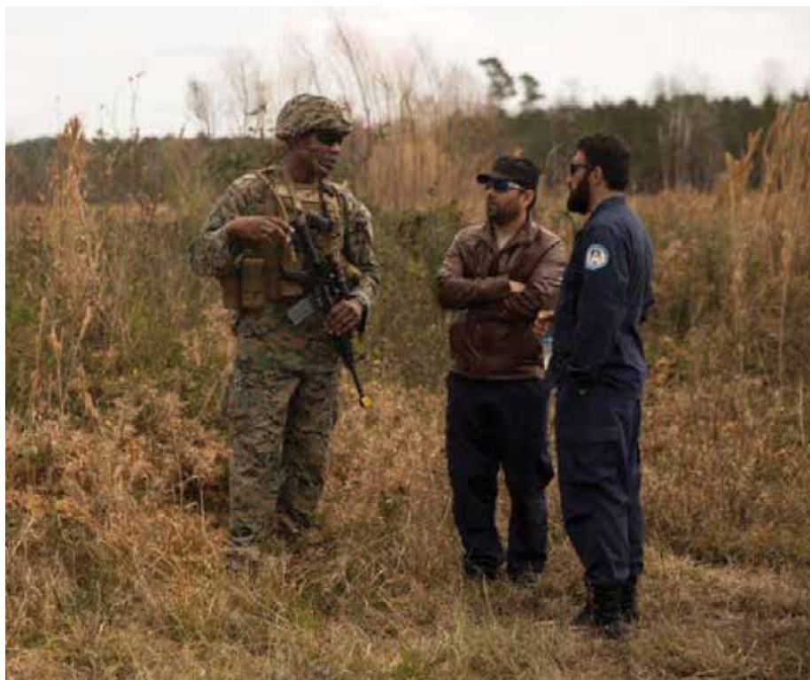
We will need to reduce the presence of U.S. forces and rely on host-nation governments and forces.

Does the knee-jerk political requirement for retribution serve as a useful policy guide in fighting an enemy that is neither understood nor visible until too late—an enemy that wins the minds of disconnected, discontented, and unfulfilled youth that includes atheists, agnostics, and middle class Jews, Christians, Muslims, and Buddhists? This extraordinary spectrum of recruits was revealed by research conducted in France in 2014 for Center for