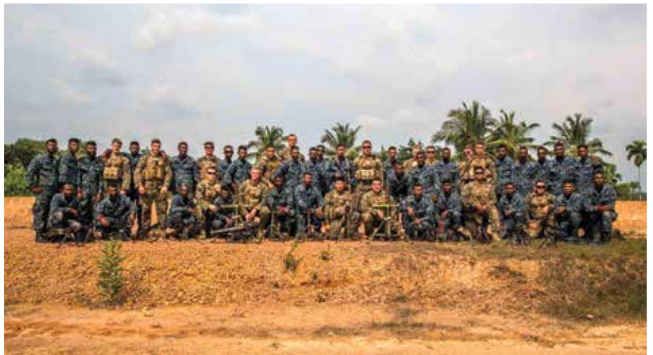
Cultural awareness and training will be required, not only for U.S. forces, but also for the average American.